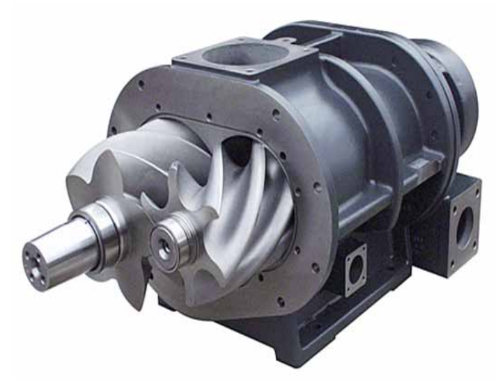
FIGURE 4: Rotary screw compressors have a higher initial purchase price, but can be a long term cost effective solution.

(CAGI) has created a form for manufacturers to state their energy efficiency for better "apples-toapples" comparison. Most manufacturers make them available on their websites.