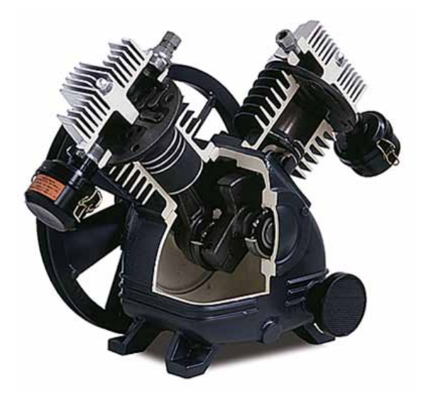
FIGURE 3: Although routine maintenance for piston compressors is inexpensive, they have much higher oil carry-over and have higher operating temperatures.

dry and clean it. A rule of thumb is that every 20 degree (F) increase in temperature doubles air's ability to hold moisture.